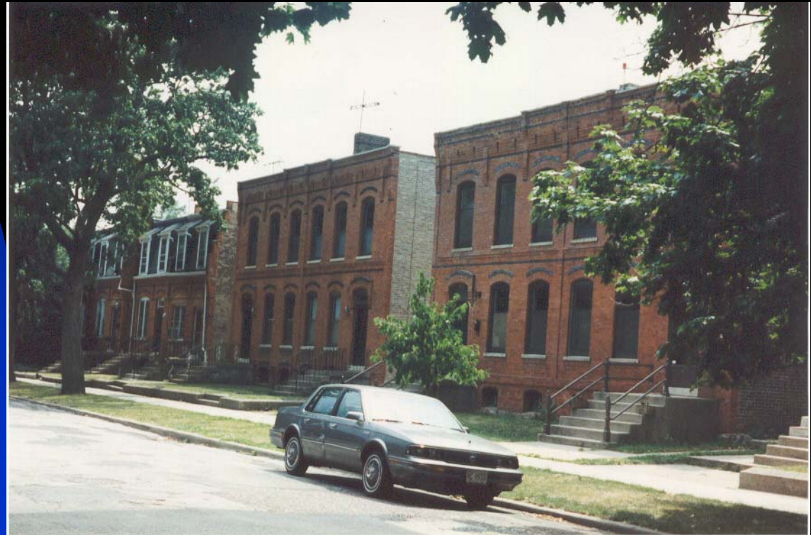
Robert H. Jackson