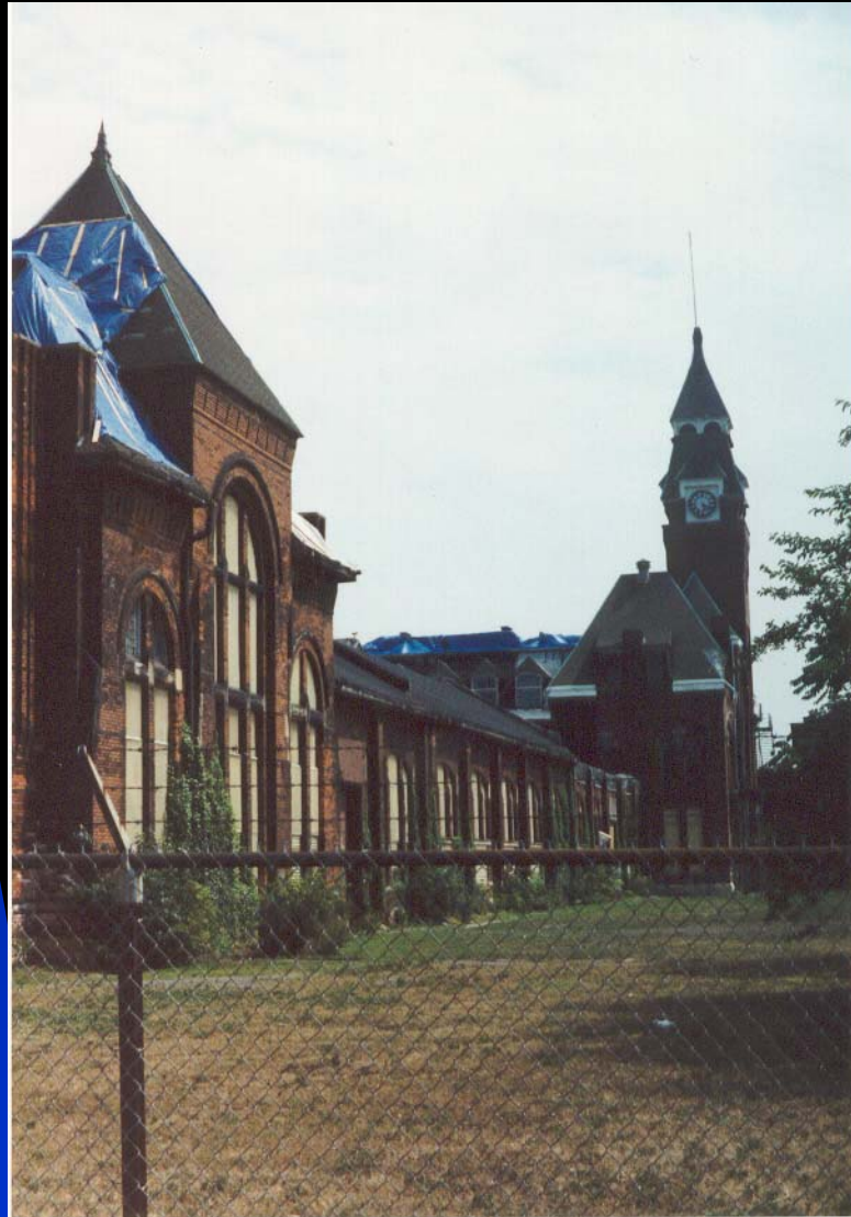
Robert H. Jackson